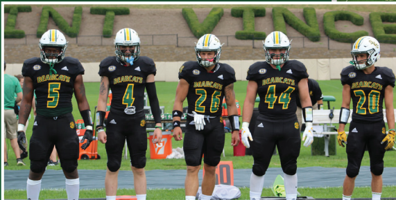
CHUCK NOLL FIELD